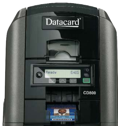
Datacard CD800 Card Printer