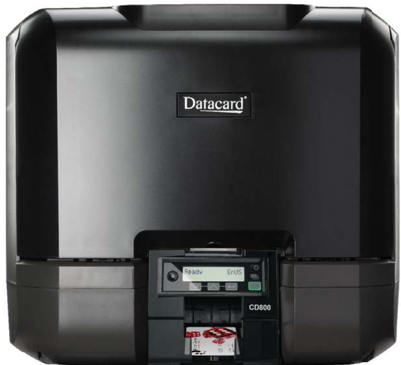
Datacard CD800 Card Printer with optional multi-hopper