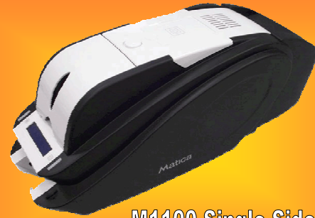
M1100 Single-Side Printer M1200 Dual-Side Printer

The M1100 and M1200 card printers are ideal for average volume single and dual-side card printing applications. They enable creation, personalization and printing of color and mono-color cards.