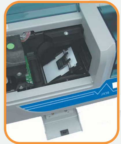
Integral flip-over unit for dual-sided printing